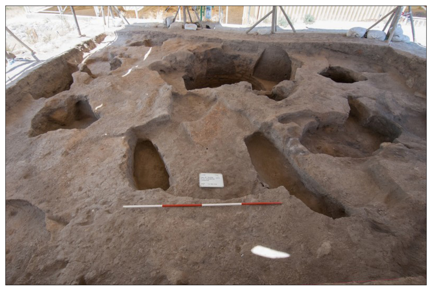
Figure 4.1. An overview of Trench 4 at the end of the 2014 excavation season.

The stratigraphic sequence identified in Trench 4 in the 2014 excavation season will be presented below. When compared with a very complicated sequence from adjacent Trench 2, it appears not much simpler as it lacks both Chalcolithic and Bronze Age strata. Further details of this sequence will be further clarified in the next season, especially in southeast corner of the Trench where some of the post-Neolithic strata have not been completely lifted to date. This year works made it possible to identify the following sequence of occupational levels: the Late Neolithic settlement, the Hellenistic settlement, the Early Islamic(?) occupation area, and the Early Islamic burial ground (Figure 4.1.)