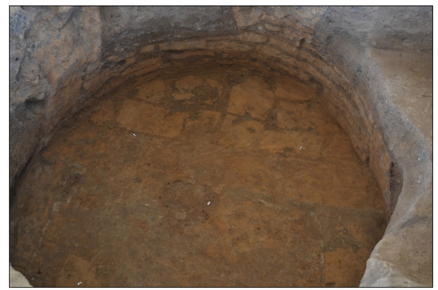
Figure 4.2. Neolithic features visible at the bottom and in sections of the Early Islamic pit (F.7378).

A solid wall running north-south was identified and recorded as F.7357 (mudbricks recorded as (21055)). This wall is likely associated with the complex B.122, revealed in Trench 3 in the previous field season (Marciniak et al. 2013: 87-88). In particular, it may probably be linked with Sp.517, located in the northwest corner of Trench 3, and western wall of B.122 (F.7260). An infill layer deposited against this wall (F.7357) from the east was identified and recorded as unit (21046). It seems to be very thick, as seen in the section of later pit cuts. It will be excavated in the forthcoming season.