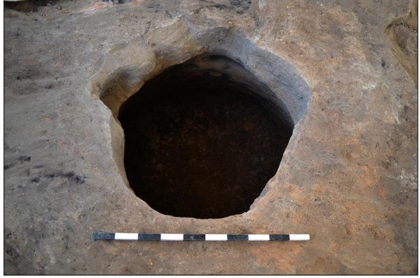
Figure 4.4. A bell-shaped Hellenistic pit (F.7366) during exploration.

close proximity to B.10, assigned to Level South T in the Hodder scheme, in the Summit Area excavated in 1996 and 1997 (see Kotsakis 1996, 1997). A considerable number of stones (more than 30) and big fragments of storage vessels were found in pit F.7366.