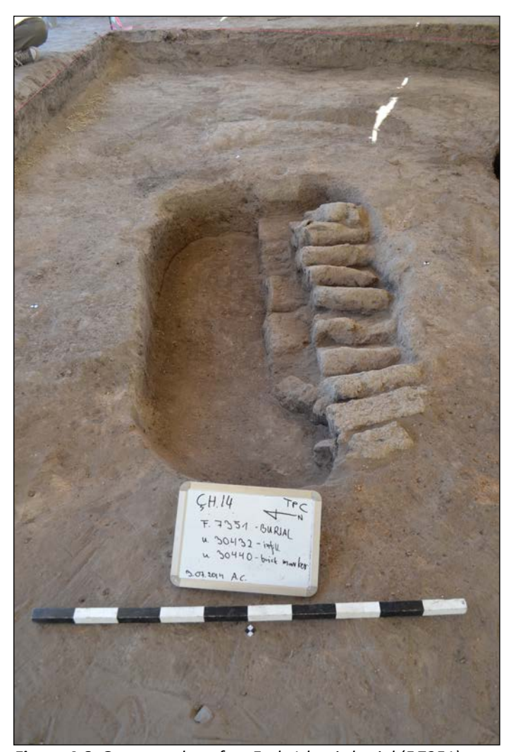
Figure 4.6. Grave marker of an Early Islamic burial (F.7351).

A majority of the fully excavated skeletons was relatively well preserved and only slightly disturbed by animal burrowing. Three graves belonged to juveniles/sub- adults, while one to an adult/older individual (for more details see 2014 Human Remains Report). The bodies were placed in a supine position with head towards the west, facing south. No grave goods were found. One particularly interesting feature is grave F.7352, where a smooth layer of clay covering the skeleton was recorded Sk(30464).